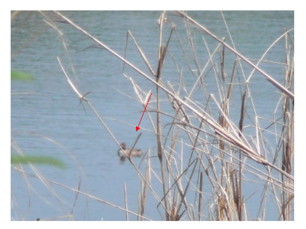
LITTLE GREBE (Tachybaptus ruficollis)